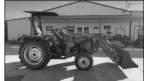
Mahindra 4540, 2WD, Canopy, gear shift, quick attach loader & bucket.....$300/MO 0% Down, 84 Month Financing Available W.A.C.