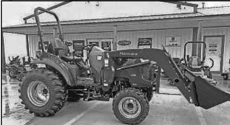
Mahindra 1635 Shuttle, 34.5hp, Quick attach loader & Quick attach bucket, 4x4 .....$290/MO 0% Down, 84 Month Financing Available W.A.C.