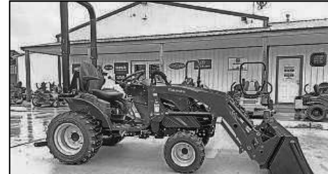
Mahindra eMax22 HST, 22hp, Quick attach loader & Quick attach bucket, 4x4 .....$195/MO 0% Down, 84 Month Financing Available W.A.C.