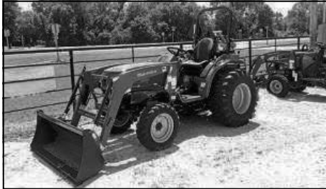
Mahindra 1626 HST, w/loader, 4x4, 26 HP .....$273/MO 0% Down, 84 Month Financing Available W.A.C.