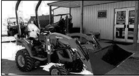
Mahindra EMax 20S HST, 20 HP, 4x4, Loader w/quick attach bucket.....$185/MO 54" Belly Mower w/Hydr. Raise/Lower. Add. $40/MO 0% Down, 84 Month Financing Available W.A.C.

*2018 data including all Mahindra brand sales