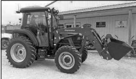
Mahindra 6075 w/cab, heat & air, stereo, 75 HP, dual remotes, power shuttle trans, quick attach loader & bucket.... $639/MO 0% Down, 84 Month Financing Available W.A.C.